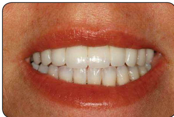
After all-porcelain crowns