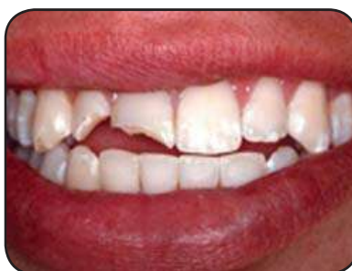
Restore a chipped tooth