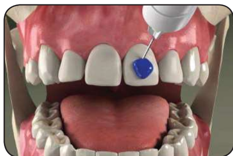
Applying the bonding agent