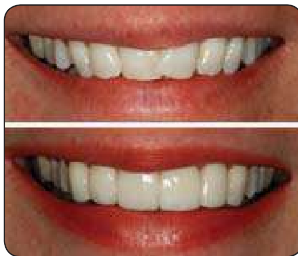
Before & after veneers