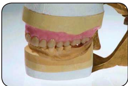
Immediate denture on model