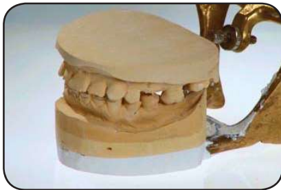
Model made from an impression

Immediate dentures have several advantages. They protect your gums and help control bleeding after the teeth have been removed. You are never without teeth, so you'll have a natural-looking appearance, and you won't need to learn how to eat and speak without teeth. Dentures also support your cheeks and lips for a more attractive smile.