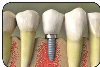
Implant post replaces root