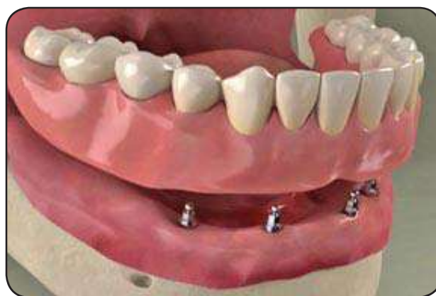
Full arch implant denture

With careful homecare and regular checkups and cleanings here in our office, an implant can be an excellent long-term solution for missing teeth.