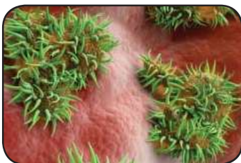
Bacteria on the tongue

And smokers? Almost all people who use tobacco have bad breath.