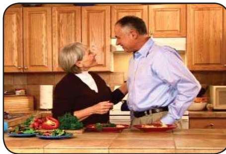
Bad breath can be embarrassing