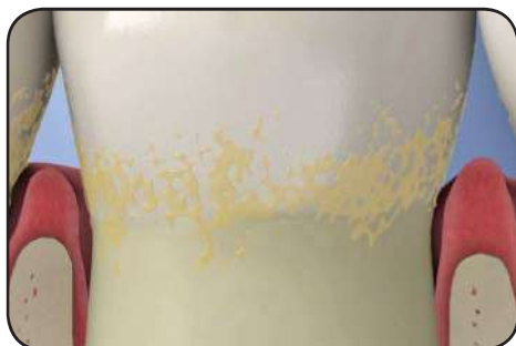
Plaque is difficult to see