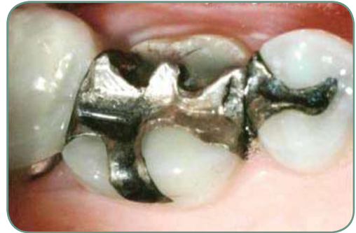
Expansion causes tooth to fracture