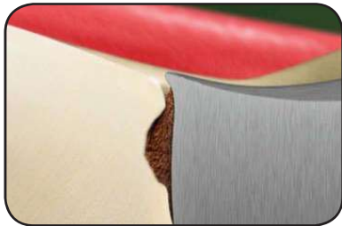
Bacteria enters between tooth and filling

Replacing a failing amalgam filling with a new restoration can prevent more decay from developing and keep your mouth healthy.