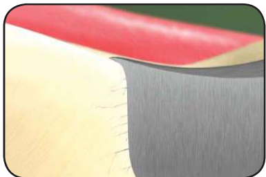
Micro-fractures in tooth